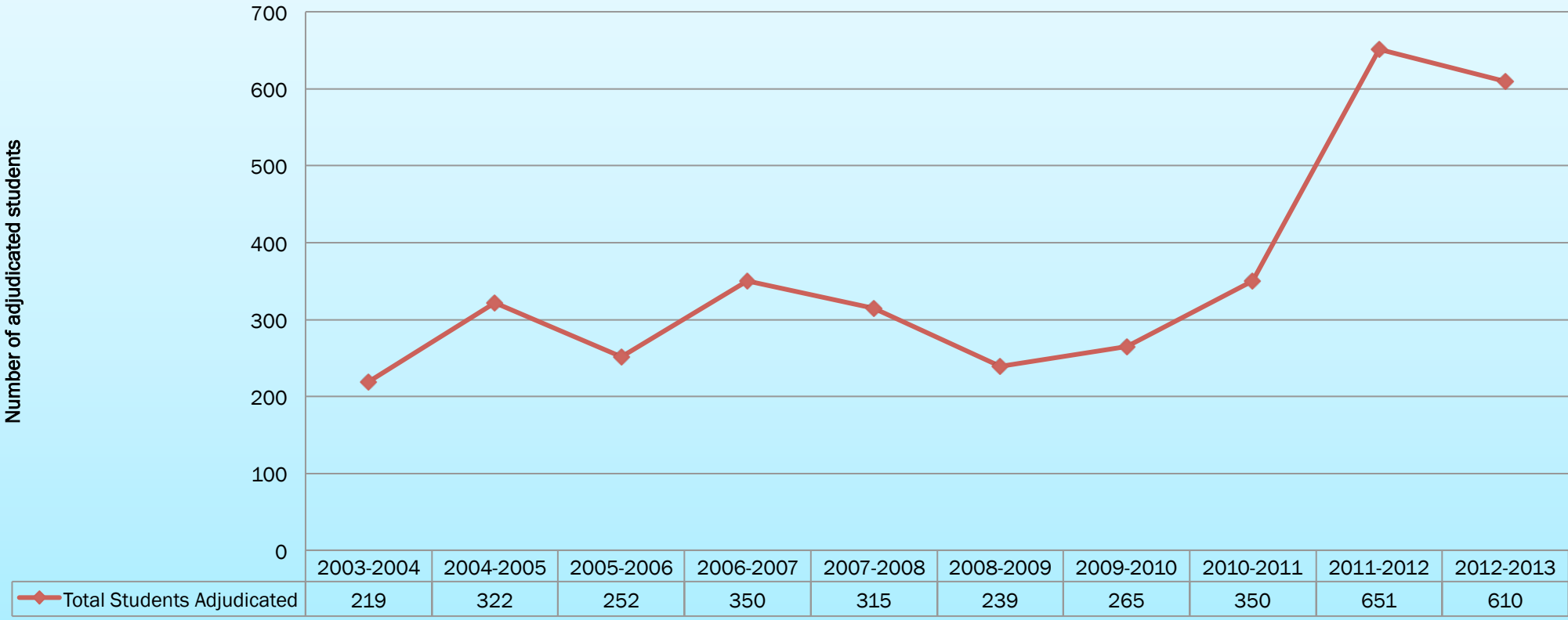
Adjudicated Discipline 2003-Present