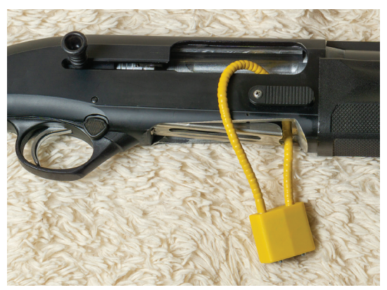
All firearms must be unloaded and approved trigger lock applied before entering the University Police Department

Any firearm that is to be registered MUST have an approved trigger lock. If you do not have one, one may be provided for you at not cost.