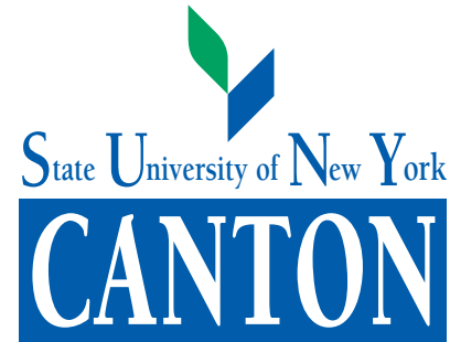
RETIRED SECONDARY LOGO