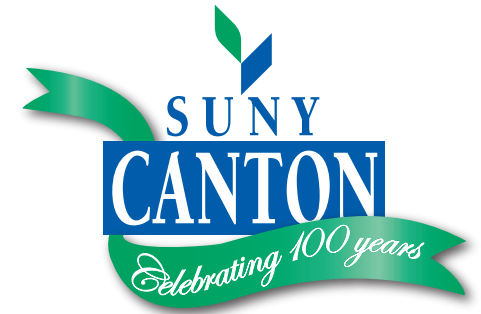
RETIRED CENTENNIAL LOGO