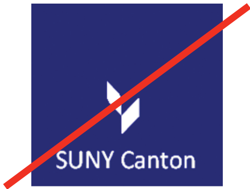
DO NOT USE UNOFFICIAL LOGOS