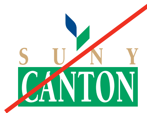
DO NOT REVERSE COLORS