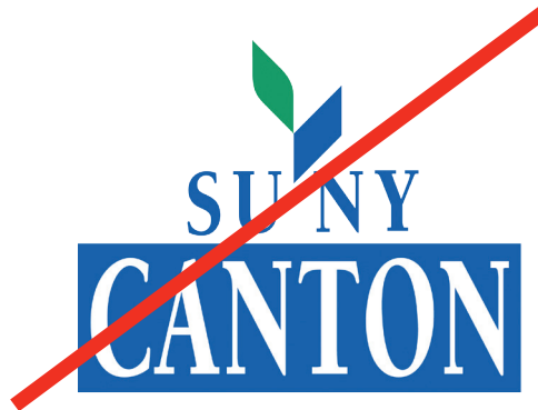
DO NOT CHANGE THE LETTER SPACING