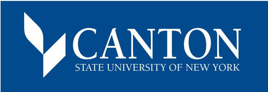
PRIMARY WORDMARK ON BLUE