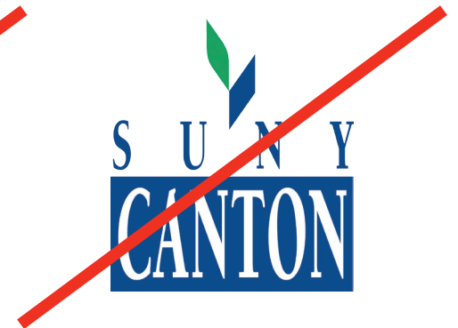
DO NOT SKEW OR DISTORT THE ASPECT RATIO