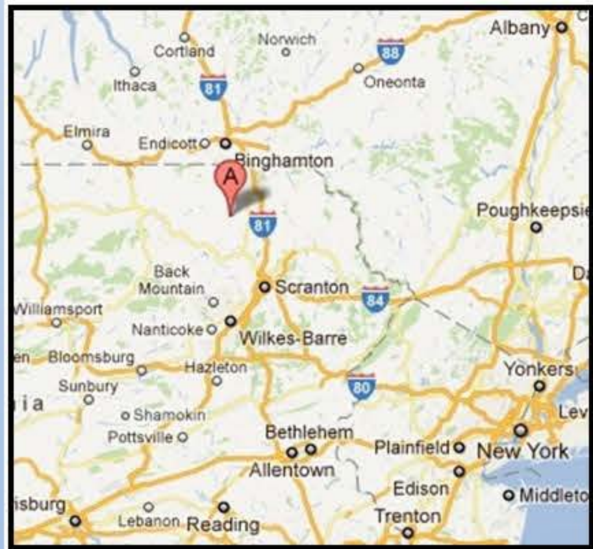
Figure 1: Dimock PA on a map

Pennsylvania was an epicenter for natural gas pipeline installation and fracking operations in the early 2010's. Just days after fracking began in the area Dimock PA was hit with a major problem, mass contamination in the fresh groundwater supply, Dimock relies on groundwater to give the people of there town fresh and clean water. The populations water turned immediately brown causing major concern on the quality of the water since fracking began. The water was filled with alarmedly high concentrations of very harmful chemicals that posed a risk to everyone in the town of Dimock.