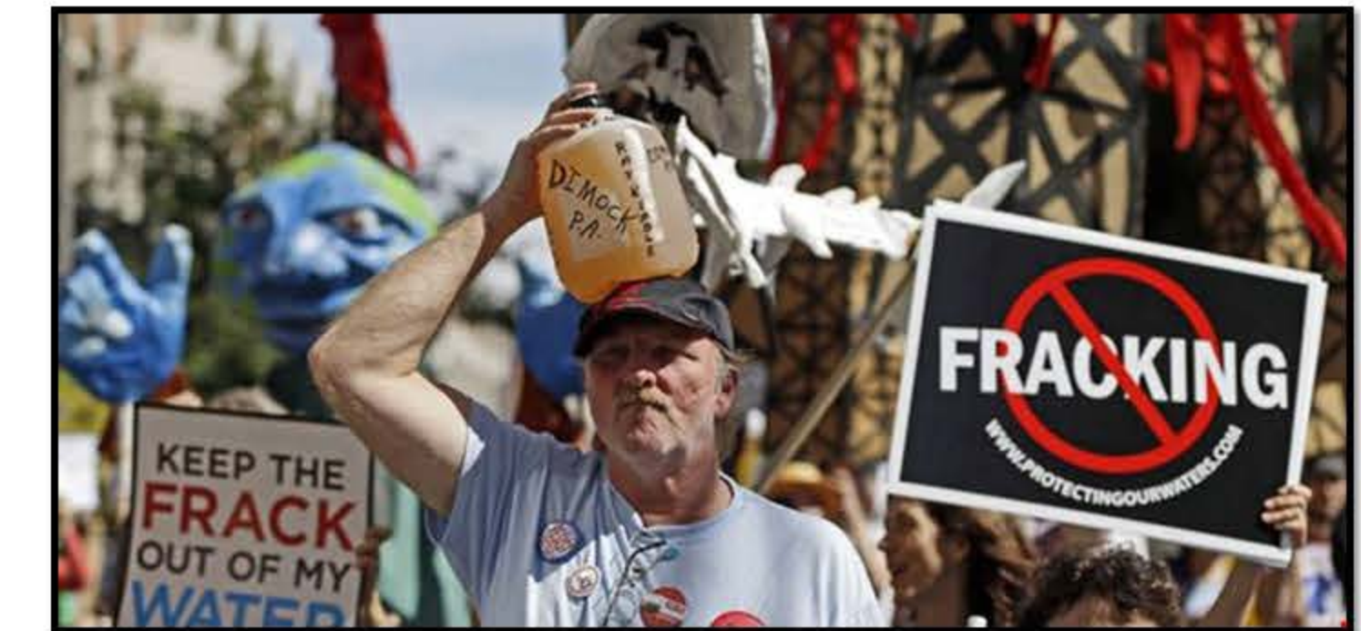
Figure 5: Protesting in Philadelphia