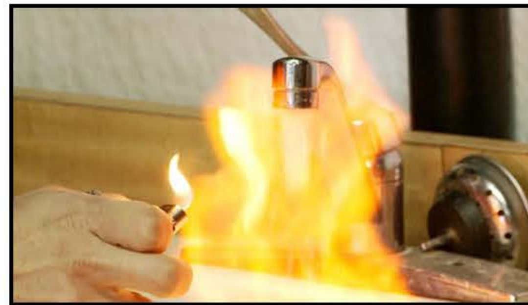
Figure 3: Methane making water flammable