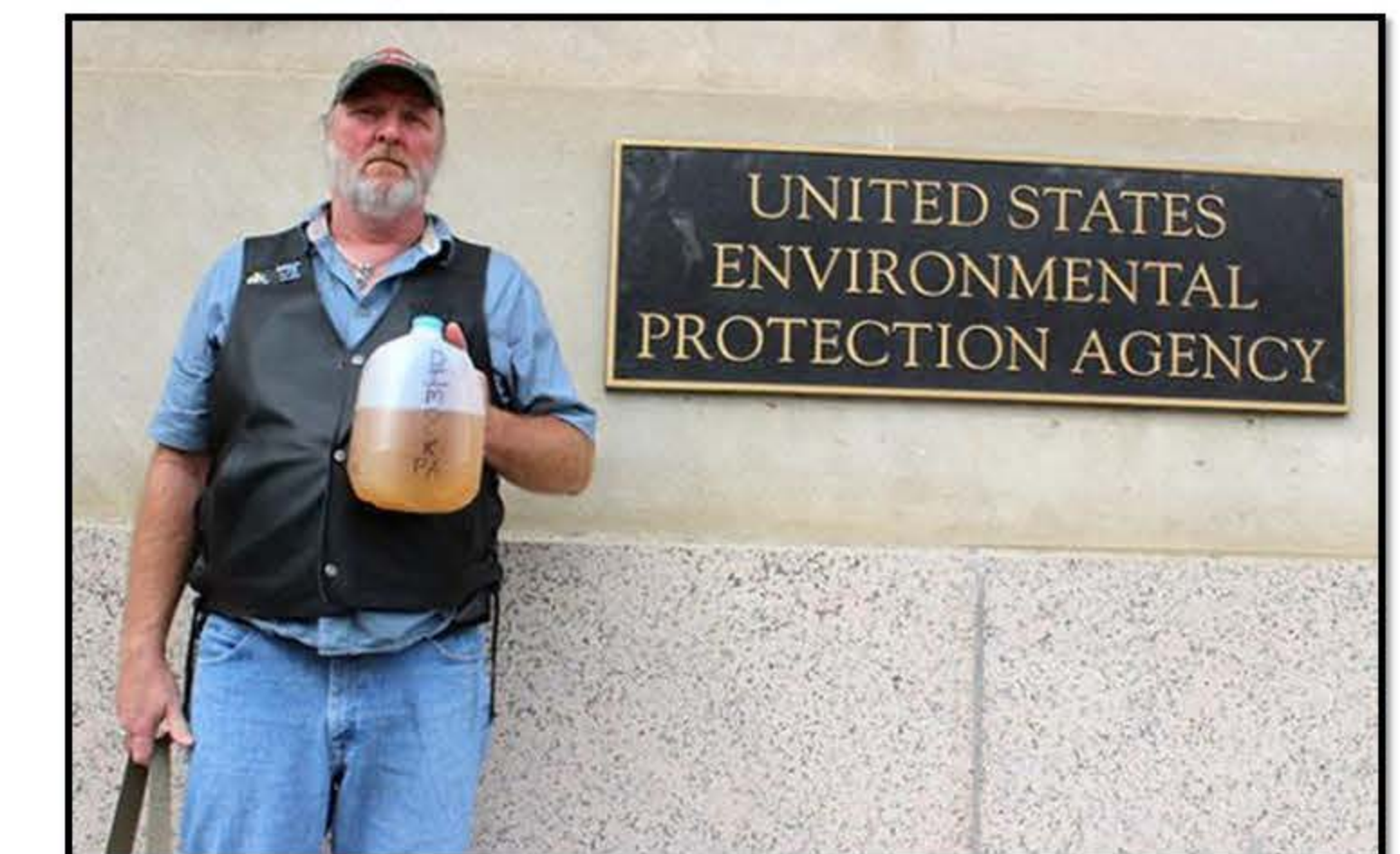
Figure 6: Protesting in Front of EPA Building