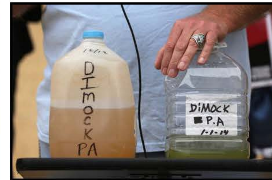
Figure 4: Water Discoloration