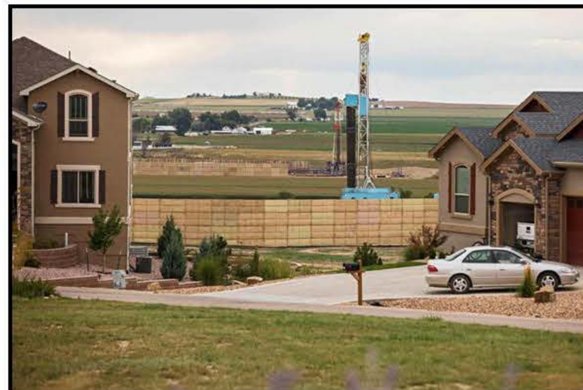
Figure 2: Oil Drilling Rig